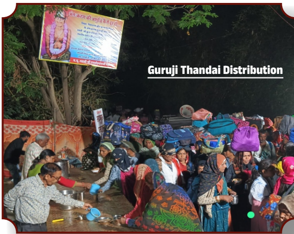
Gurji Thandai Distribution